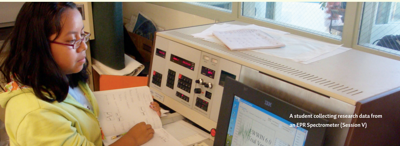
A student collecting research data from an EPR Spectrometer (Session V)

REFUNDS: There will be no refunds of tuition deposits ($50/camper/session). Campers who attend only part of a session for any reason will not receive a refund for days not attended. Once registered, changes in sessions can be made only if space permits. Tuition and fees (not including deposit) will be refunded if a notice has been received in writing no less than two weeks prior to the start of the session. After this period, tuition is due in full regardless of your child's attendance. If a course is cancelled due to insufficient enrollment, all fees paid for that session will be refunded (including deposit).