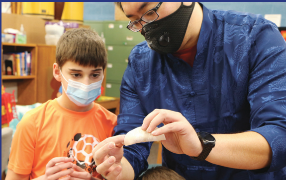
A student learning how to make dumplings (Session III)