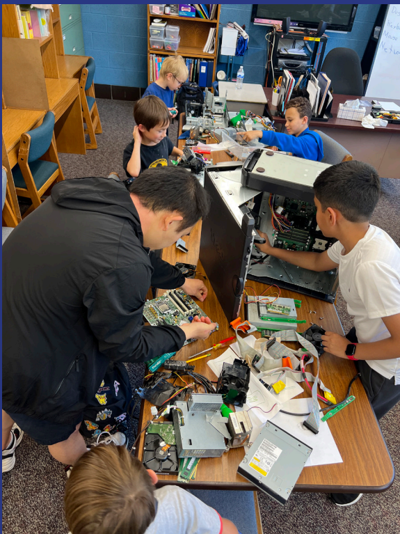
Students disassembling desktop computers (Session I)