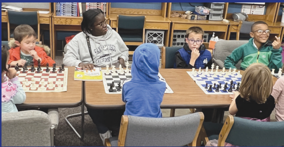
Students learning chess (Session IV)