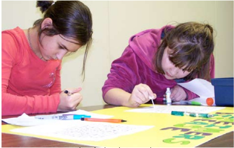
Just a few last minute corrections....