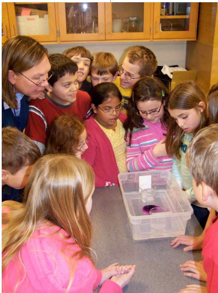
So, what is this supposed to do?

If you want tickets to the Auction at the discounted price, you need to order them by Friday.