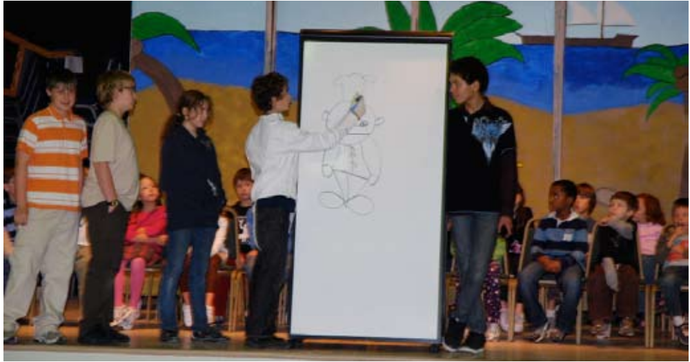
From Grandparents' Day last Wednesday