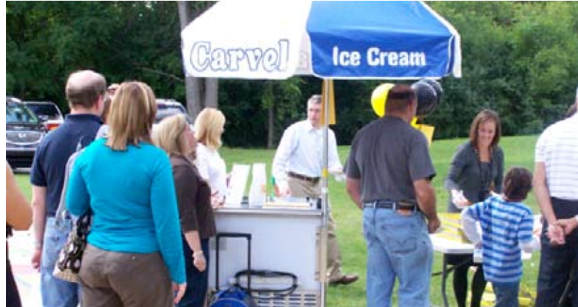
Steppingstone...kids?...waiting in line for ice cream

28555 Middlebelt Road Farmington Hills, MI 48334 Phone: 248.539.1666 Fax: 248.539.1929 www.steppingstoneschool.org